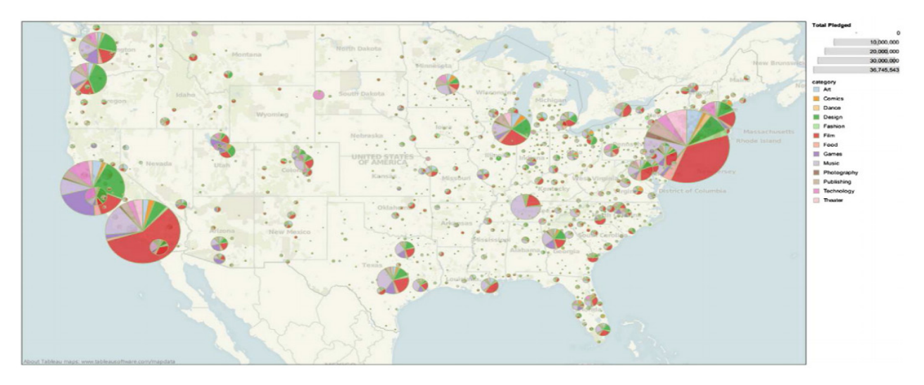
Figure 2 – Geographic distribution of projects by success and by category Source: Mollick, 2014